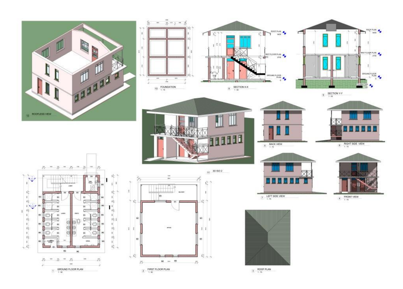
Box 2: Jinja sanitation facility