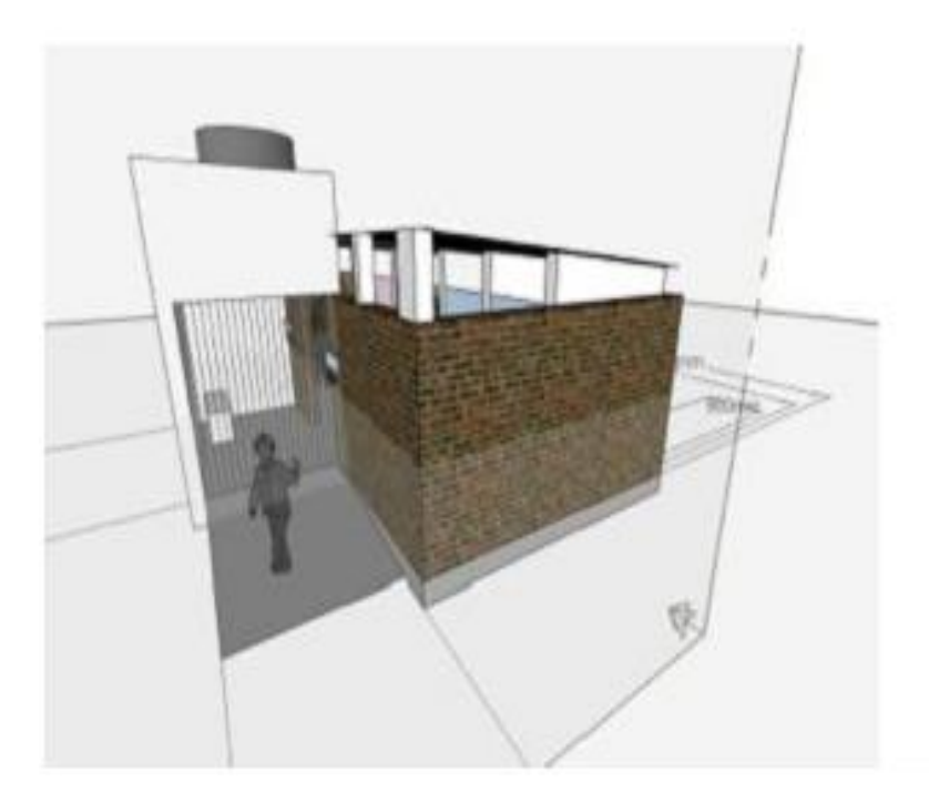
Box 6: Prototype design for communal toilet block in residential areas