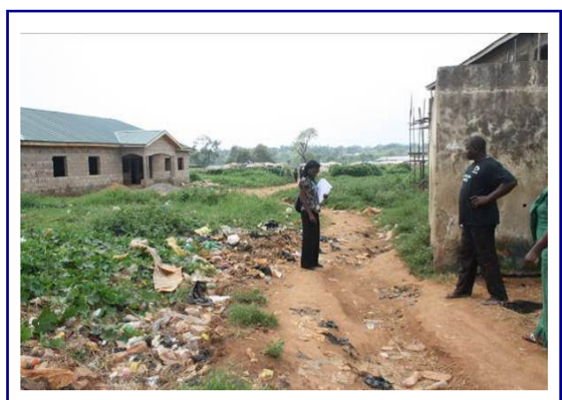
Getting to the facility can be the first problem