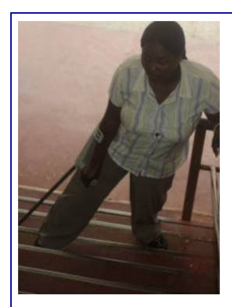
Disabled student participating in an accessibility audit of her college facilities.