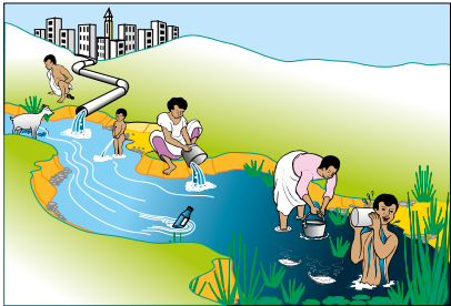
Figure 2. This picture shows a woman collecting water from a stream which could be polluted by human excreta and urine, animal and domestic wastes, soaps and detergents, pesticides and fertilisers