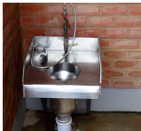
Photograph 4. Sluice for sample disposal