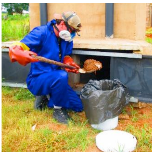
Photograph 1. Actual sampling