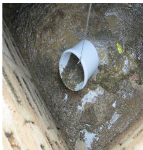
Photograph 2. Sampling containers