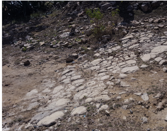
Photograph 3. Bedrock outcropping near mid-elevation mountain spring in El Cercado, showing fractures and joints

Ten of the springs had spring boxes (Figure 1). This type of infrastructure is intended to serve two purposes. First, it captures the spring water into a tank or pool, making it easier for piping to downstream communities and on-site collection by humans. Secondly, it is intended to protect the spring water from contamination. To construct a spring box, first the hillside at the spring is cleared of vegetation and large stones are placed on the slope at the location of discharge. These stones are held in place by metal wire mesh or screen. A concrete box is then constructed around this stone wall. The box has several exit pipes for cleaning out sediment, release of air, and flow to communities. The box also has a metal lid with a locking mechanism to prevent vandalism or access to the pooled water in the box. Of the spring boxes assessed in the study area, only one was in good condition. The rest were in various states of disrepair, or were crudely constructed. The risk of contamination to water is high, even for a properly constructed and maintained spring box, especially at the points where the box walls meet the earth (Figure 1), at the lid if it is not water-tight, and at the runoff area up-slope.