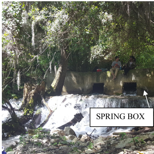
Photograph 1. High elevation (1,280 metres AMSL), high flow spring in the El Cercado basin shows spring box and conduction pipe to downstream community

The location (terrain settings and proximity to communities) of the springs varied widely. Some springs were observed to have lower flow and generally were located at lower elevations (less than 760 meters AMSL), while others at higher elevations (greater than 915 metres AMSL) generally showed higher flow (Photographs 1 and 2). The lower flow springs are closer to and typically provide water for smaller communities, while the largest spring, and headwaters of the river that runs through town, provides water for the town centre and a few adjacent communities; this latter spring was located furthest from human development than any other spring assessed during the assessment periods. Generally, the springs located on the highest mountains in the basin are located in tree-covered ravines or gullies, while the lower elevation springs are located on hillsides (i.e., not in a ravine or gully, see Photograph 2). At all springs, the land use at or up-slope from the spring was characterized, through observation, as forested area or agro-pastoral. The bedrock seen throughout the study area is carbonate rock (limestone) which is highly fractured and jointed (Photograph 3).