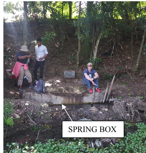
Photograph 2. Lower elevation (685 metres AMSL), lower flow spring in the basin; conduction pipe to downstream community lies in the spring pool and is not shown in the photograph