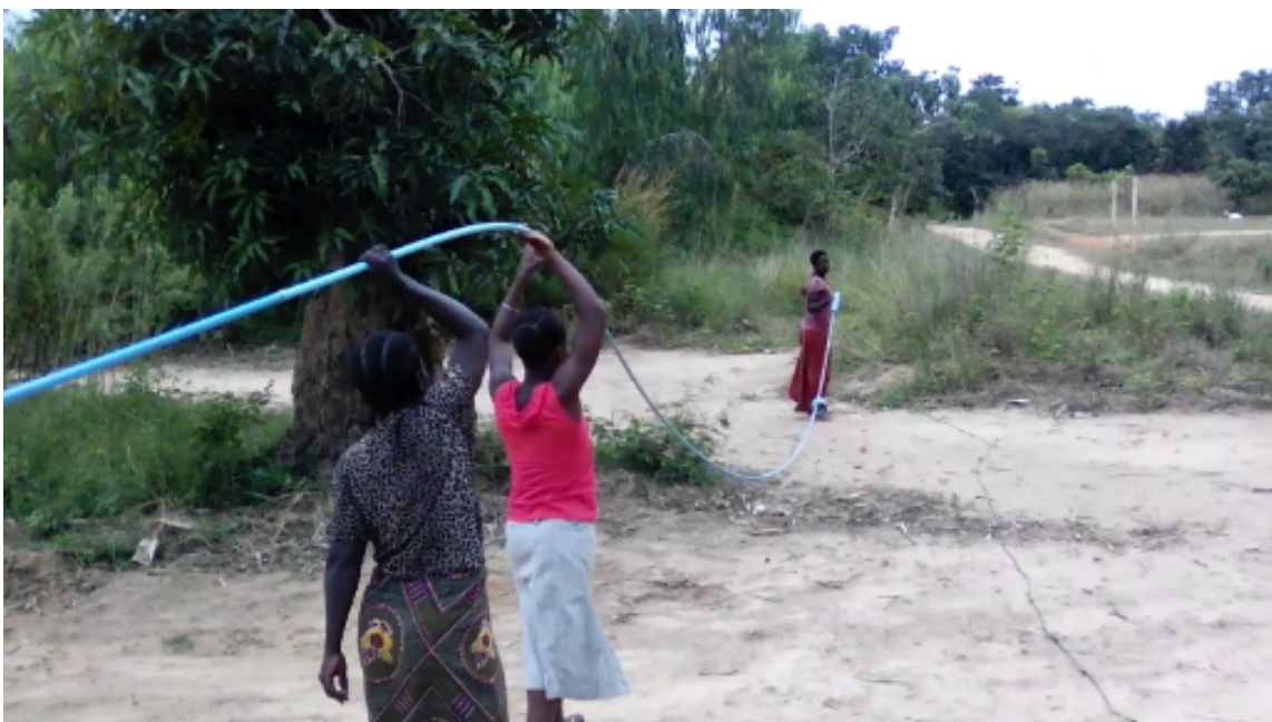
Photograph 1. Women removing the rising pipe to fix a broken rope. Communities are able to maintain the rope pump on their own.