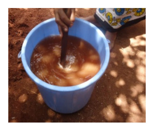
Photograph 3. Water treated with P&G water purifier (at 5 min. of wait after stirring)