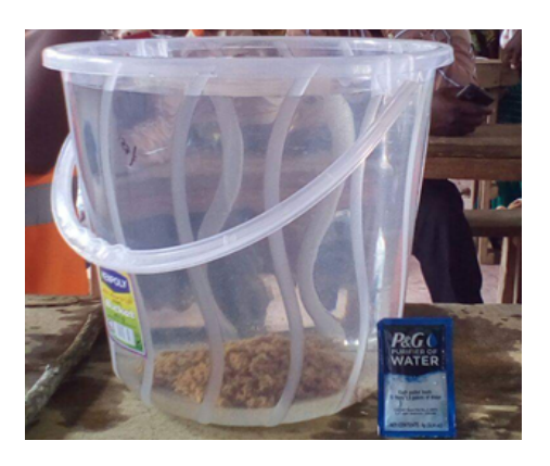
Photograph 4. Water treated with P&G water purifier (at 5 min. of wait after stirring)