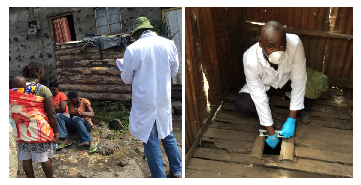
Photograph 1: Survey of users and monitoring monthly fill up measurement of pit latrines

The study was carried out between December 2014 and September 2015. A cross sectional design was applied to provide insight into the design and management practices. Questionnaires were administered to household heads and an observation schedule was executed at every visit to the facility by during monthly fill up measurements. On the other hand, the longitudinal study approach was used to monitor changes in the pit volume for 10 months. Data collections using the two study designs are illustrated in Photograph 1.