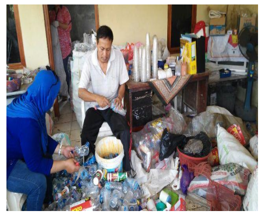
Photograph 2. Sorting activity in Kenanga Peduli Lingkungan Waste Bank