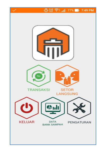
Photograph 4. Application for Waste Bank management