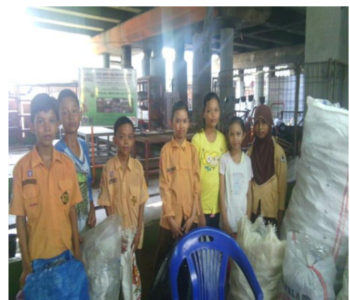
Photograph 1. Children deposit their solid waste into Maju Bersama Waste Bank