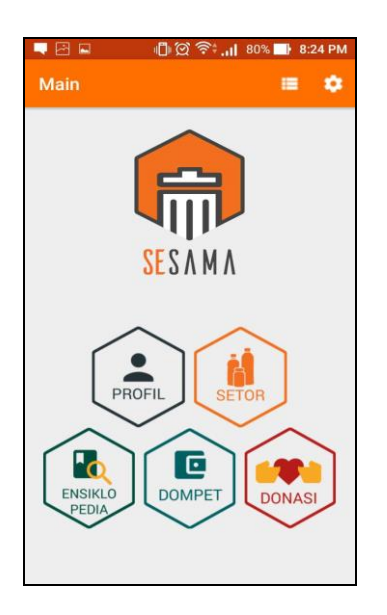
Photograph 3. Application for Waste Bank customers