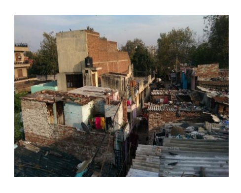
Photograph 1. Safeda Basti location