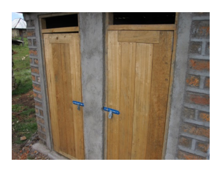
Photograph 2. An example of girl friendly latrines