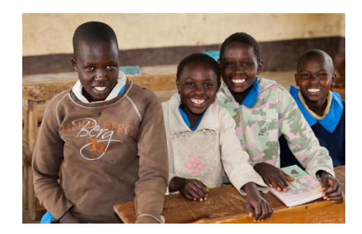
Photograph 1. Participants in the Girls for Girls programme

The G4G programme is evaluated on a bi-annual basis and results from the 2015 evaluation found that 96.8% of girls surveyed want the G4G programme continued in their school; 90.5% of teachers felt that yes they was an increase in the attendance levels of girls since the introduction of G4G programme in their school; 77.1% of the girls surveyed who have been involved in the G4G programme have seen a change of attitude and understanding towards menstruation among their families and communities since the introduction of the programme; and that 82.6% of girls surveyed who had received a sanitary kit stated that they had not missed any days of since receiving their sanitary kit. Qualitative data gathered from the survey brought to the fore the need for more to be done in the community rather than just the school. The girls surveyed felt that education around MHM was poor among women and that the subject needed to be discussed more openly in order to dispel harmful taboos.