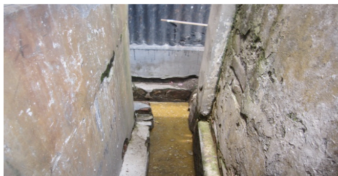
Photograph 1. Direct discharge of sludge from containment