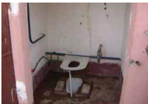
Photograph 1. Inclusive toilet model for paralysis affected person_1