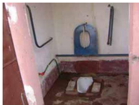
Photograph 2. Inclusive toilet model for paralysis affected person_2

Seven existing models have been showcased with different type of features depending on the type of disability along with dimensions and tentative cost. The models shared have been constructed in Jharkhand and Odisha with community engagement and are examples for reference. There can be better and improved options that can be designed.