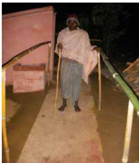
Photograph 3. Toilet reaching facility for person with partial blindness

To make the facilities physically accessible, the handbook has three main sections namely: (i) getting to the toilet or reaching facilities; (ii) getting inside the toilet; and (iii) usability of the toilet.