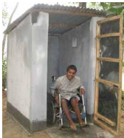
Photograph 4. Wide toilet entrance for person using wheelchair