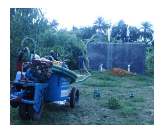
Photograph 1. Vacutug used by Conservancy Department

However, there is limited transport equipment and with no incentive to safely dispose, the workers typically apply the principle of the fastest disposal route. Some are known for leaving containments and their surroundings unclean due to the inappropriate use of small scale equipment such as a bucket and rope. There is a lack of operational safety, variable service fees and additional fees being levied.