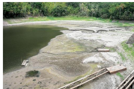
Photograph 2. Hermitage Dam