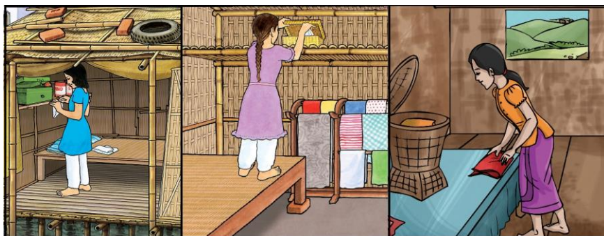
Figure 2. Illustrations from MHM pocketbooks for Urban, Rural and Chittagong Hill Tracts

MHM modules were prepared for rural, urban and Hill Tracts regions, with illustrations and information relevant to each area.