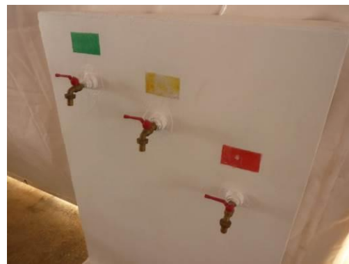
Photograph 2. The three lines of the water network