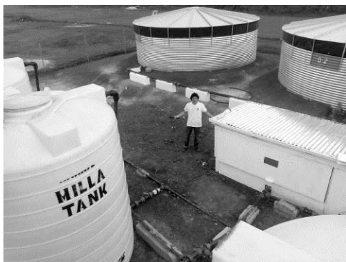
Photograph 1. Water tanks area

Moyamba ETC is equipped with 2 dedicated boreholes, 3 storage tanks of 70m 3 (Oxfam Tank), 2 tanks of 10m 3 for 0.05% chlorine solution, 2 tanks of 10m 3 for 0.5% chlorine solution, 3 main pipelines (one for each water type) with demand pumps, and 1 emergency pipeline for 0.5% water supply in the High Risk area.