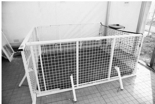
Photograph 3. A play pen to keep children safe

Among these activities are: ambulance receiving, patients transfer (from triage to the wards and from a ward to another), patients discharge and some special activities such as the installation of child-friendly spaces in the patients' wards to avoid them moving around inside the High Risk zone and putting themselves and others in danger.