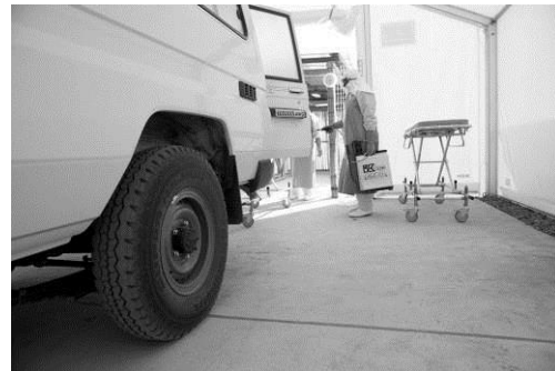
Photograph 4. Ambulance receiving a disinfection

The IPC team is also the first responsible for critical accident management. Every problem that occurs to the team inside the High Risk zone (accidental exposure, problems with PPE, mistakes in undressing, mistakes in staff, patients or material flows, etc.) have to be reported to the IPC manager for immediate action if needed and for recording. In case of accidental exposure to infected body fluids or sharp accident, the IPC manager has to report to the medical director for medical follow-up.