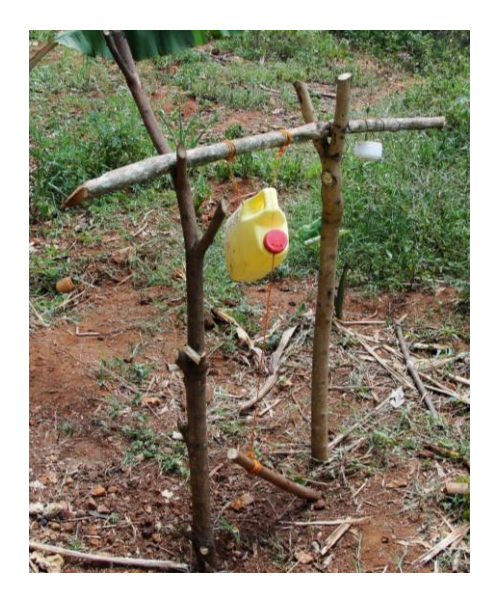
Photograph 1. TippyTap