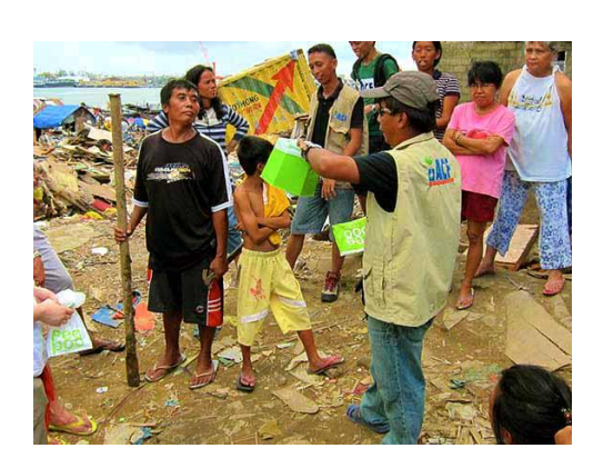
Photograph 2. Community meeting ACF