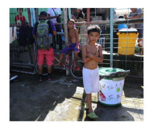
Photograph 5. Community Collection