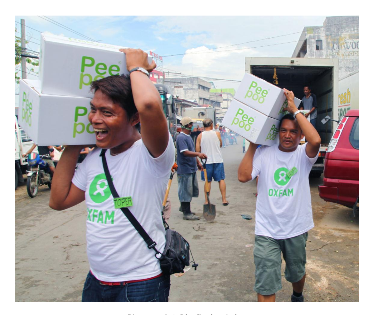
Photograph 1. Distribution Oxfam