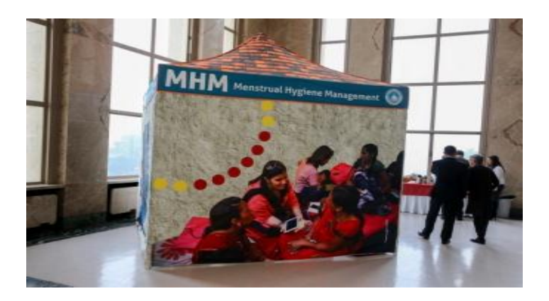
Photograph 1. Counselling & Advocacy in MHM Lab