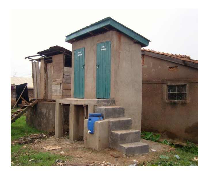
Photograph 1. Example of a U-ACT toilet (right) next to the old facility (left)

Working with a high-quality, local NGO, and offering well-built sanitation facilities enabled us to construct over 150 VIP latrines for 1,500 people, which, as can be seen in Photograph 1 and as indicated by our regression results, are a significant improvement over the currently available facilities.