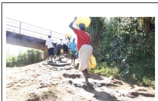
Photo 1. The drudgery of ferrying water from a spring before rehabilitation