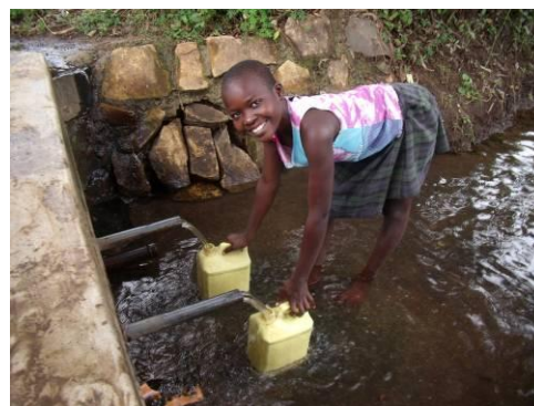
Photo 2. Protected Spring, Kisumu