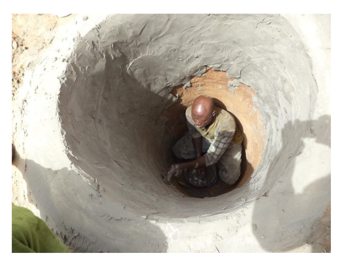
Photograph 8. Latrine walls rendered with cement to stabilise walls