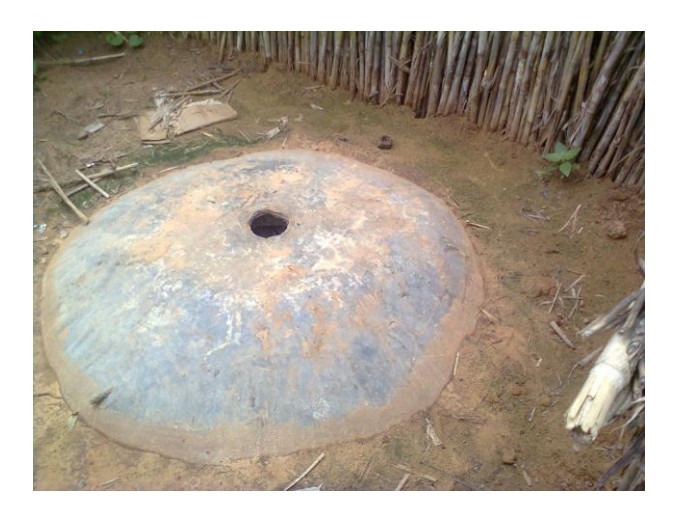
Photograph 3. The finished product of the tire type of latrine