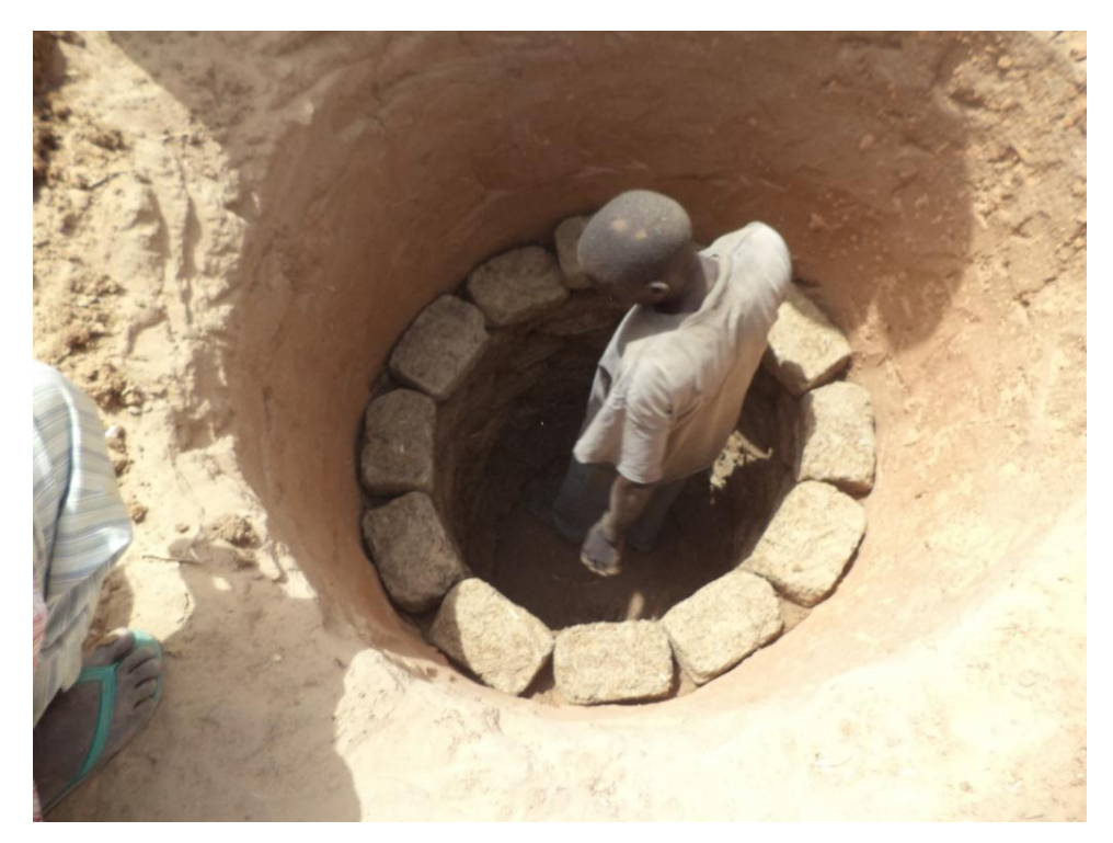
Photograph 6. The mud block type