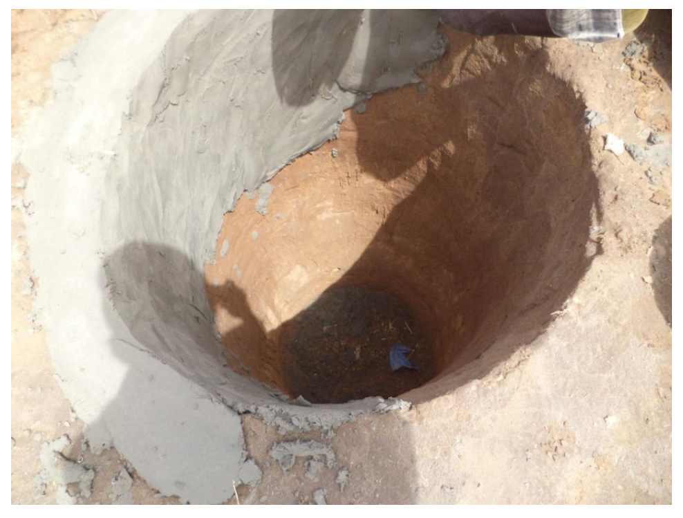
Photograph 7. Latrine walls rendered with cement to stabilise walls