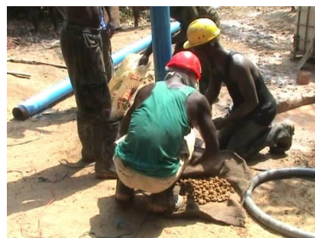
Figure 10. Installation of the clay sanitary seal.