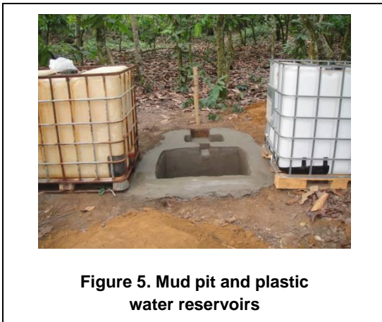
Figure 5. Mud pit and plastic water reservoirs

The field training began with a meeting with the villagers to select an appropriate site for the well based on: village preferences, topography, likely depth of the water table and distance from sources of pollution (latrines and garbage dumps). Once the site had been selected the layout, digging and plastering of the mud pit was begun. The mud pit provides a reservoir for the drilling fluid and a place for the cuttings to settle out of the drilling fluid, Figure 5. The mud pits should be dug and plastered with cement mortar the day before the drilling crew arrives. The villagers should be asked to bring water to fill the plastic reservoirs so that drilling can begin as soon as the crew arrives on site.