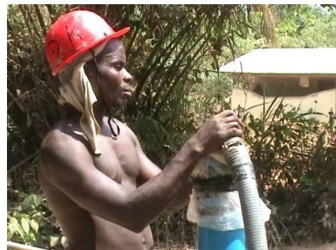
Figure 8. Flushing the drilling polymer out of the well