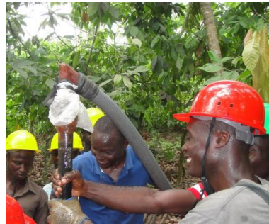
Figure 2. Swivel to allow rotation of the drilling rod without tangling the hose