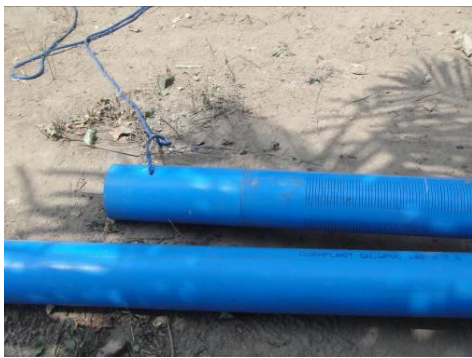
Figure 7. Preparation of the casing for installation

In order to keep the costs of manual drilling reasonable well development is achieved by pumping the borehole with a 1 HP electric submersible pump powered by a 2.5 KVA generator, Figure 11. The pumping rate exceeds the rate that will be required for a hand pump, generally in greater than 12 litres/minute. In addition to pumping at a higher than anticipated discharge, the well can be surged by using the submersible pump as a plunger. The 100 mm diameter pump is shut off and raised above the water level and then lowered rapidly a meter or two into the water creating a surge in the 125mm inside diameter casing. The surging helps to move fine particles from the aquifer through the gravel pack and redistributes the remaining material to increase the permeability close to the well screen. As can be seen in Table 1 the cost for the generator and submersible pump is much lower than the cost would be for a compressor to use the air lift method to develop the boreholes.