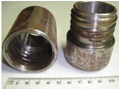
Figure 1. Coupling for drilling rod (50 mm)

remains in place. It uses a ball bearing welded to the supply pipe and sealed with a metal plate to prevent leakage. Welding on a ball bearing requires care to ensure that the bearing is not damaged.