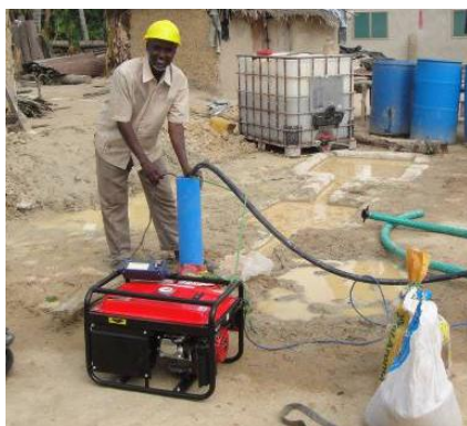
Figure 11. Developing well using a 1HP submersible pump and 2.5 KVA generator

During the contract period the well drilling businesses will purchase the drilling tools through a deduction of $160 from the price of each borehole, enabling them to completely pay for the tools by the end of the 20-well drilling contract.