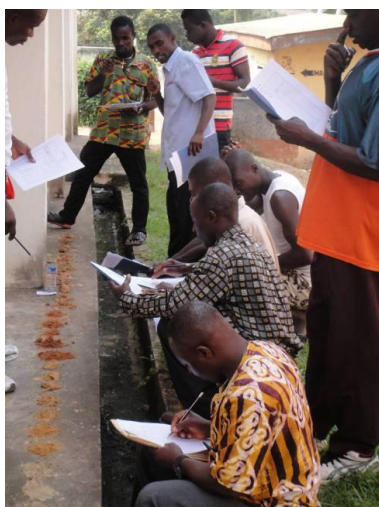
Figure 3. Trainees making a drilling log from samples

Using the reference “Understanding Groundwater for Manual Drilling” from the UNICEF Toolkit a course was given to 18 trainees from the two selected business and 3 trainees from a local NGO that will provide supervision during drilling. The training program allowed the drillers to gain an understanding of groundwater flow and how geological strata are deposited over time. They also had practical exercises giving them experience in determining the texture and assessing the permeability of different strata that they will encounter while drilling. The course covered the importance of sampling and keeping an accurate drilling log. It provided trainees with practice in designing wells including the placement of the screen and gravel pack and the location of the sanitary clay seal based on the drilling log. The key factors in selecting a well site including distance from sources of pollution and the importance of protecting both the well and the aquifer from pollution and how to do it were also covered. Practical topics covering the use of drilling mud, hygiene, and well development were also addressed. Upon successful completion of the course the trainees had a better understanding of what is happening down the hole both during and after drilling than many of their machine drilling colleagues. The course provided them with the information that they will need to drill high quality boreholes.