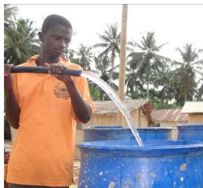
Figure 12. Discharge during development 35 litres/minute