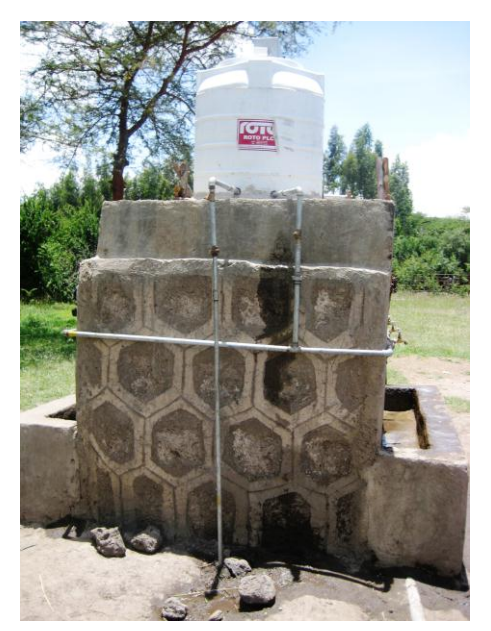
Photograph 2. Gravity fed pipe system, front view