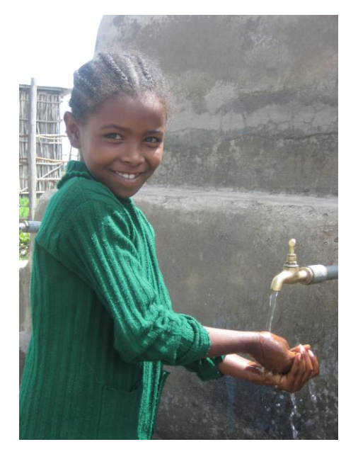
Photograph 3. A young student washes her hands at the newly installed multi-tap hand washing facility adjacent to the well with elevated hand pump