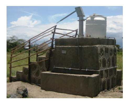
Photograph 1. Elevated hand pump with 250L storage tank and multi-tap hand washing facility at Weja Bati Primary School