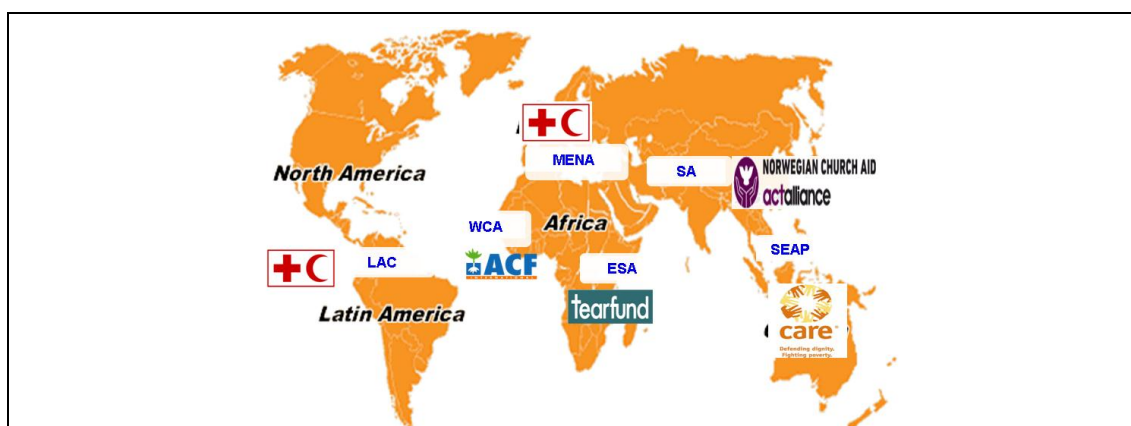
Figure 2. Regions and corresponding agencies involved in the RECA project

The focus countries where each RECA worked were selected according to the disaster risk faced by the country. An initial list of high risk countries was created using different global risk indices (World Risk Report, the ECHO Global Needs assessment vulnerability and crisis index and the OCHA Global Needs assessment). Through a consultative process of selection each RECA concentrated their work in two or three countries. A standardised baseline report was prepared for each focus country. These surveys provided a broad analysis of general in-country WASH capacity.