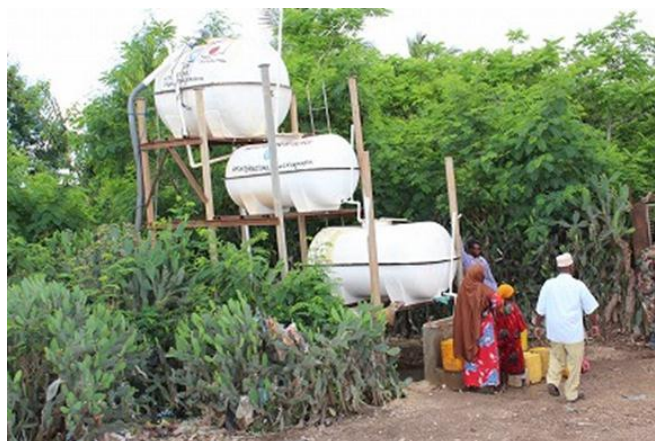
Picture 1. Three tank water treatment system in Afgoye, Somalia

water from these rivers is very poor due to high turbidity of more than <200 NTU, and dumping of waste material.