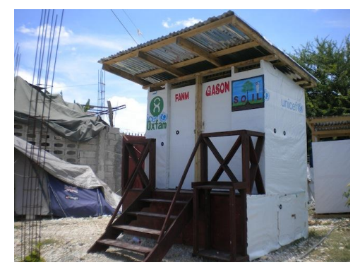
Photograph 1. SOIL UD Toilet, Jan 2011.