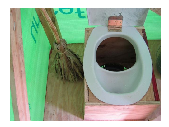
Photograph 3. Fibreglass UD seat made in Port au Prince