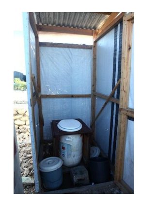
Photograph 4. Non-separating children's compost toilet