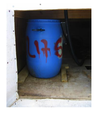
Photograph 2. 15-gallon drum with wooden guides.