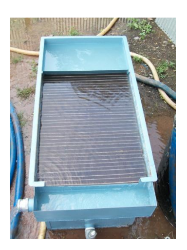
Photograph 1. IPS testing facilities in Pune