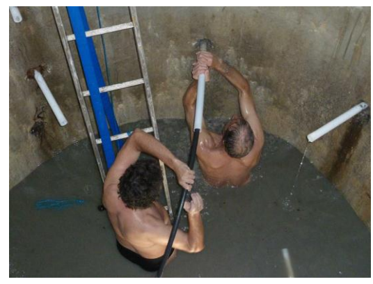
Figure 3. As part of the "permanentization" proper pump houses were built (left). To increase extraction of water while carefully using the top layer of the limited fresh groundwater, horizontal filter pipes were flushed into the sandy soil up to 6 meters out from the central large diameter well (right).