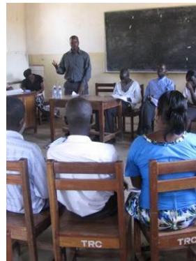
Photograph 2. District learning session in Kitgum, Feb. 2012