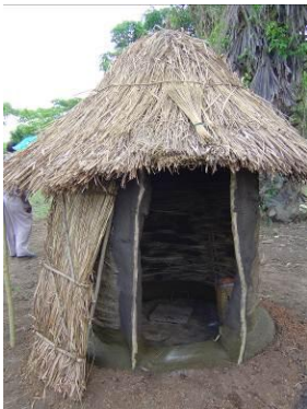
Photograph 1. An arbor loo in Gulu district

Another sign of the stronger emphasis put on sanitation and hygiene by local stakeholders concerns monitoring practices. Local government and NGOs indeed need good data on coverage and practices to be in a position to plan and implement adequate remedial actions. At the beginning of PILS, participants of the learning sessions undertook baseline surveys on sanitation and hygiene. The HAB, the main sanitation and hygiene monitoring tool of the Ministry of Health, was at first seldom in use in the region; at the end of the project, all three districts were promoting it. Local governments and NGOs were negotiating so that they all use HAB for collecting data on sanitation and hygiene in communities, while some NGOs were supporting the districts to obtain more copies of the book and others were working on its translation in local language.