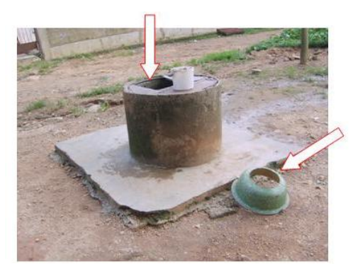
Photograph 2. Partially covered well; the perforated bowl cover used for the covering of the un-covered part is placed next to the well

Examples of self supply dug wells showing varied degree of covering; Source: Field data