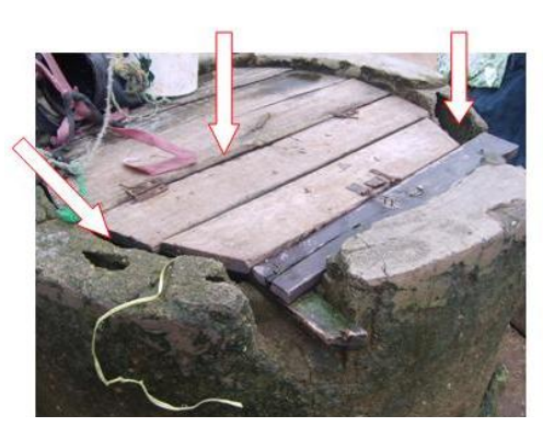
Photograph 1. Fully covered well with gaps within planks, and see-through openings between cover and head wall

Experience with this study however shows that 'yes or no' sanitary scoring approach assumes a rigid correspondence between the assessment criteria and the observed sanitary faults. Hand dug wells, which are generally expected to be completed with hand pump, for instance, are not. Well covers exist in varying degree of materials and covering range (Photographs 1 and 2). In the study area, there is also no known regulation for especially self supply well design, source and water safety. Water source construction, user activities and source handling of self supply sources are typically a function of source ownership, investment capabilities and water use priorities. In which case construction quality, design and source handling varies. The extent of variation in any of observed sanitary faults do not therefore usually fit a 'yes or no' assessment score method, but arguably captured in the 1-5 scoring approach.