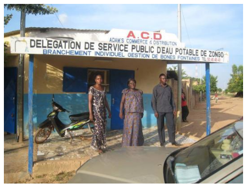
Photograph 3. ACD (one of the 5 delegatees) comprises 2 book keepers, 1 meter reader and 1 head of agency

Photograph 2. All delegates have computers and manage spreadsheets for billing and customer management