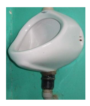
Photograph 3 - Urinal inside the pilot toilet, Rukungiri