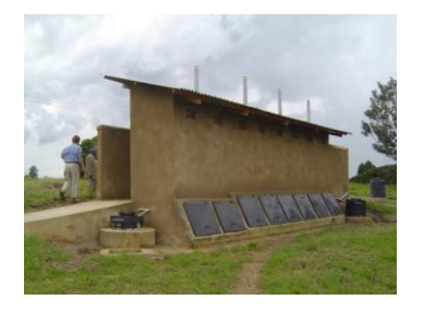
Photograph 2 - Rear view showing access panels