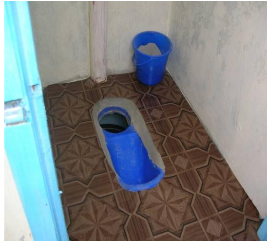
Photograph 3. Inside a UDDT –note the squatting U-D pan and the bucket of ash.