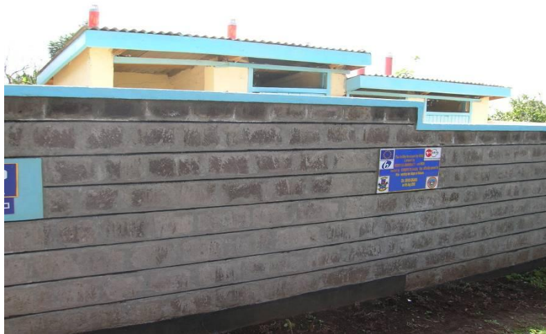
Photograph 1. Completed Pilot UDDT in Nakuru, Kenya

The faeces are collected directly in the vault underneath the toilet chamber. The material is stored in 50 litres open containers. The dimension of the vault is 1100mm (length) x 900mm (width) x 750mm (height). This space is enough to allow up to four 50 litre containers to fit in. Once a container fills, it is pushed aside to allow an empty bucket to be placed below the hole and the full one to dry. It is recommended that the filled container remains in the vault for a period greater than six months to allow pathogen die-off (WHO, 2006). Urine is collected in a 30 litres plastic container. For the mentioned facility, provision is made for discharging the excess urine through an over flow pipe into a soak away pit, with the possibility to collect the urine for a later use.