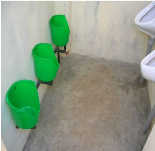
Photograph 2. Water less urinals- green ones for nursery school children.