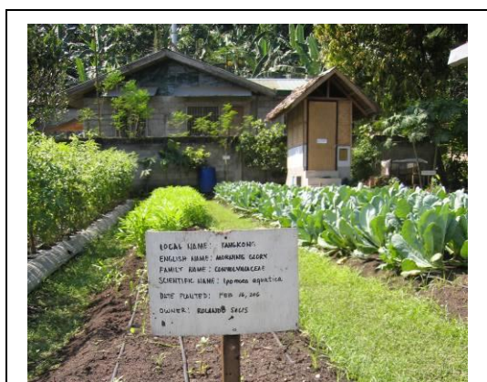
Figure 1. Drip irrigation, school gardens, and UDD toilets are combined in many ecosan projects in Mindanao, Philippines

Further, allotment gardens have been created in poor neighbourhoods of Cagayan de Oro as part of the project. The UDDTs produce fertiliser which is used in the gardens. Accompanying research by the Philippines’ Xavier University of Agriculture has shown that the nutritional standard of the poor urban families taking part in these activities has considerably improved as these families now grow their own fruit and vegetables (Figure 1). This has not only improved their general health, but has also enabled gardening families to increase their income by up to 20% through the sale of their produce (Holmer and Drescher, 2005; SuSanA 2008b).