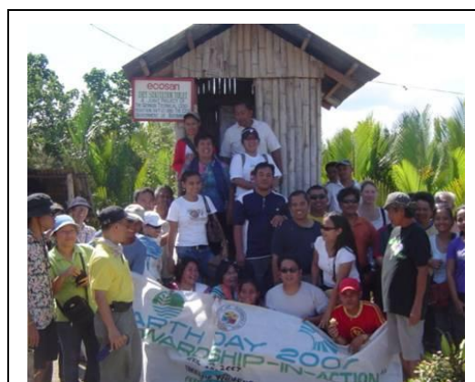
Figure 2. Ecosan Training of Trainers workshops contribute to a faster up-scaling and spreading of the approach