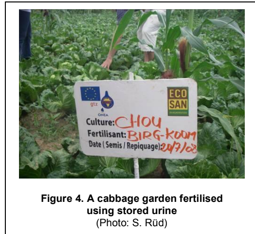
Figure 4. A cabbage garden fertilised using stored urine

Through a broad range of activities over the three year project period the project aims to reach up to 300,000 people in Ouagadougou, informing them of the existence and the possibilities of ecosan, and supporting 1,000 households in obtaining appropriate and affordable closed-loop sanitation.