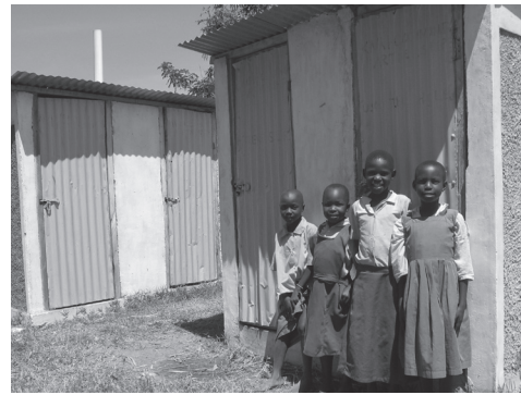
Photograph 3. Separate toilet facilities for boys and girls help to address important gender issues relating to privacy and safety, Siaya District, Western Kenya