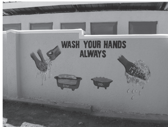
Photograph 1: Example of a hygiene promotion “talking wall” at one of the assisted primary schools, Wakiso District, Uganda