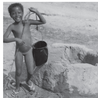
Photograph 2. Young girl drawing water with “gogga” at Azanga well in Bawku