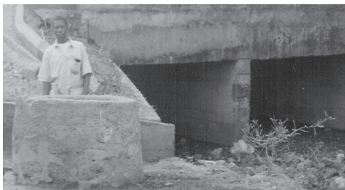
Photograph 1. A well sited close to drainage system at Bawku

The sanitation of wells, boreholes and toilet facilities were observed to be poor. Most wells were sited very close to gutters often choked with piles of garbage and liquid wastes in Bawku (Photograph 1). Most water carrying receptacles were old rusty iron buckets and local containers (“gogga”) constructed with vehicle inner tyre tubes and tied to nylon or jute ropes, often left in the muddy surroundings of the well or coiled into containers when unused. It sometimes became playing tools for children (Photograph 2). High rate (41.7%) of open space defecation in the district coupled with location of some wells closer (<500m) to major drainage systems could contaminate groundwater with faecal coliforms.