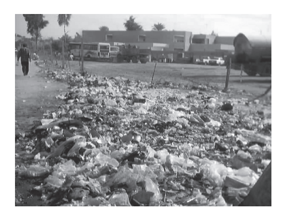
Photograph 2. Garbage everywhere