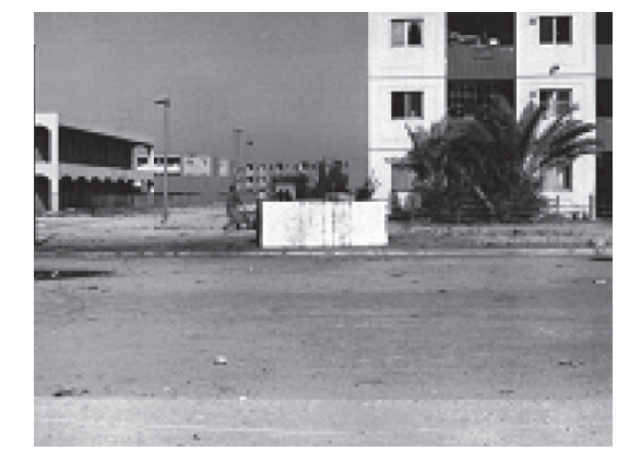
Photograph 4. Now we can walk