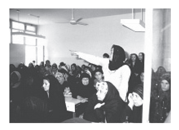
Photograph 3. Hot discussions

Workshops and meetings were organized for the communities, in order to involve them from the beginning in the rehabilitation of their neighborhoods, and participate in the identification and the prioritization of the issues to be tackled, together with the cooperative societies and the municipality focal points. Their awareness was also raised on the necessary measures to take in order to maintain their living environment. These workshops contributed to build the confidence of the communities towards the municipality in its efforts for the rehabilitation of the public services in these areas. Local institutions (women and youth unions) were very instrumental in supporting the project team in persuading the communities to approach and accept the municipalities as partners, and building mutual trust between them. The project committed itself to the goals of gender equality in human settlement development, and ensured the participation of gender representatives from women's stakeholders groups in all the steps of the project cycle and especially in decision making. School teachers also played a big role in these workshops and in conducting door-to-door surveys.