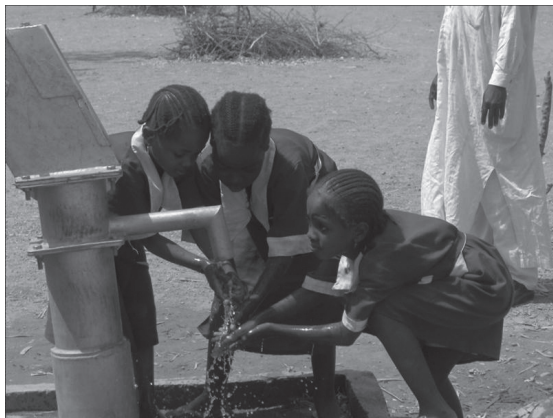
Photograph 1. Hand pump borehole at Central primary school, Shiroro, Niger State