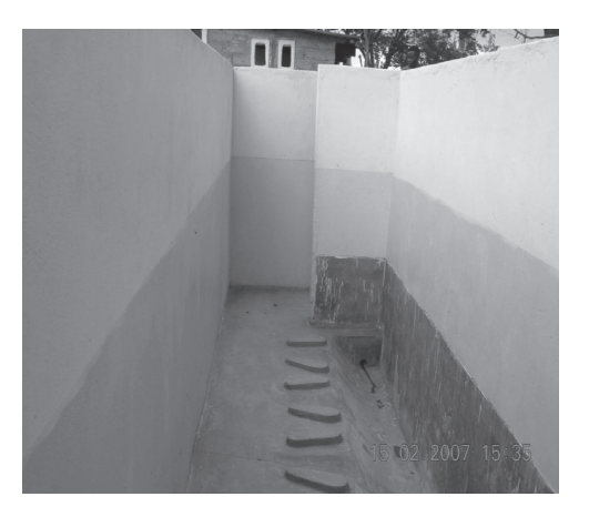
Photograph 3. Proposed girls urinal