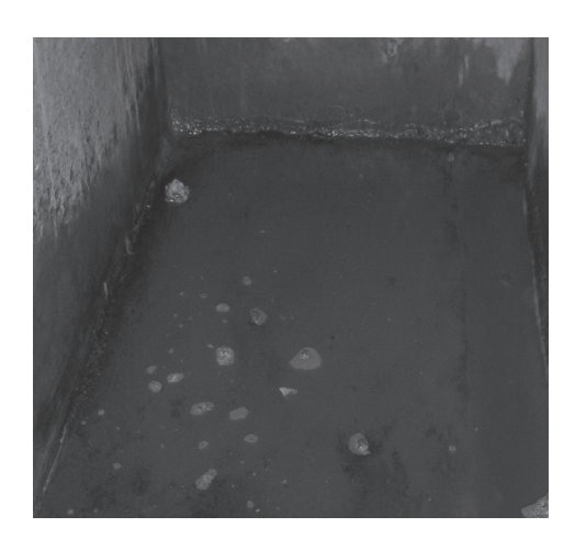
Photograph 1. Toilet floors wet with urine in one of the schools