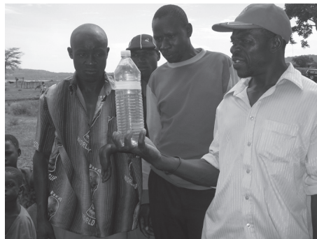
Photograph 1. Water committee members in Lwanika, Uganda, discussing the water quality

Providing some of this information to monitoring systems at district and national level, as well as to the implementing NGO and donors, has the relevance to interlink all involved parties with the operation and maintenance of the water system. Uganda is in a process of decentralisation where responsibility and authority is given to districts, but still needs time to institutionalise the changes. However, already now, sub-county and district levels are involved in these projects and receive all reports. Information feeds into the national plans to provide safe water to all rural growth centres, but substantial efforts are needed to properly coordinate these data for improving both the quality and quantity of water supplied.