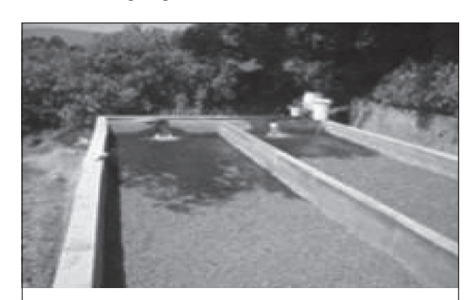
Photograph 1. Short circuiting of DRFs at the inlet

The gravity head available at the site could have been used for hydraulic cleaning in the filters at Gampola and pusellawa. Gampola filters are malfunctioning due to insufficient hydraulic cleaning. The performance of Pusellawa filter also could have been enhanced if the available head is utilized. This situation could have been corrected at the commissioning stage.