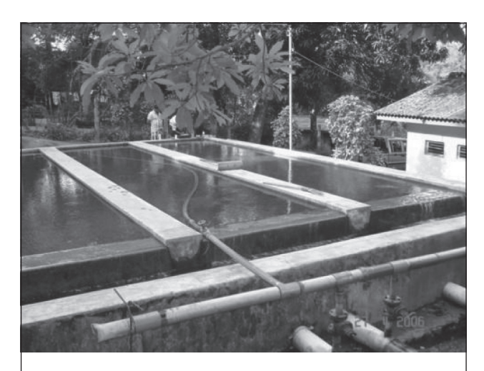
Photograph 2. Rectangular URF at Aranayake

Major problem affecting the sustainability of the large circular filter observed is inadequate hydraulic cleaning, which leads to filter short circuiting and solidifying sludge within filter media. Lack of regular cleaning arrangement has also contributed to filter clogging. Success of rectangular filter operation is mainly due to low filter area per drain pipe and the operator's knowledge and regular cleaning of filters before the blockage of filters. Poor performance of Medawela rectangular URF is mainly due to lack of operator's commitment.