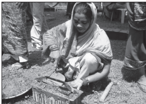
Photograph 4 : Even after the training is over, the SHG women continue producing

UNICEF and the state Government started this process in mid 2005 in one of the tribal districts of Orissa. Today, the process has spread to 8 districts and has established 105 production centres with over 5000 village level motivators and 2500 women functionaries who are actively supporting the Total Sanitation Campaign.