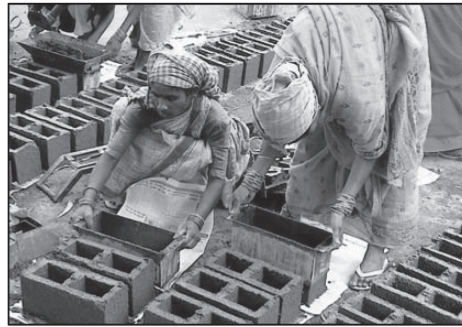
Photograph 2. Hollow blocks getting ready

towards bringing about the desired behavioral changes at the household level that includes use of toilets and adopting correct hygiene practices such as water handling and hand washing at critical time. The motivators earn Rs 50.00 (a little over $ 1 from the Government for sensitizing and creation of demand for one household toilet.