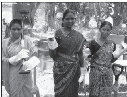
Photograph 1. SHG members getting ready to build toilet blocks

The current strategy is aimed at establishing/expansion/up gradation of all-women Production Centers in each of the UNICEF assisted district. Each Production Centre has a minimum of 25 women member from the local SHG. The women have been trained on various related subjects varying from production of sanitary ware, hygiene promotion and basic accounting/book keeping. These Production Centers double up as training centres for training of women masons who are encouraged to procure hardware materials from the production centers for the construction of individual, community, school and anganwadi (pre-school) toilets. Selection of the village motivators is jointly carried out with the full involvement of the women Production Functionaries, Masons and the Community leaders to maintain certain level of linkages and trust. Each production center is given a number for easy identification and each trained mason is given an identification card and linked with the Production Center. Processes are on for officially registering these Centres with the District Water and Sanitation Missions as authorized producers and builders of toilets under the TSC.