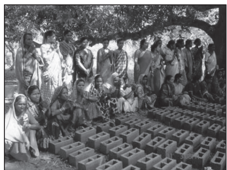
Photograph 3. Self Help Group members proudly displaying their products

Different stakeholders have different roles to play in establishing this network of SHG-led Production Centres. Some