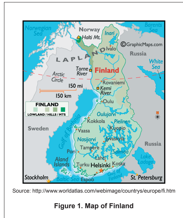
Figure 1. Map of Finland

338,145 km 2 , out of which about 10 percent (32,000 km 2 ) is water, 69 percent forest and 8 percent cultivated land. The population of Finland was 5,255,580 at the end of 2005, and the population density was thus 16 persons/km 2 . Of the population, 65 percent live in towns or urban areas and 35 percent in rural areas. About 1 million people live in the Helsinki Metropolitan area.