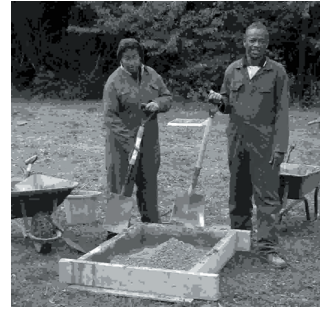
Photograph 1. The physical differences between men and women need to be considered

As infrastructure can have a positive or negative impact