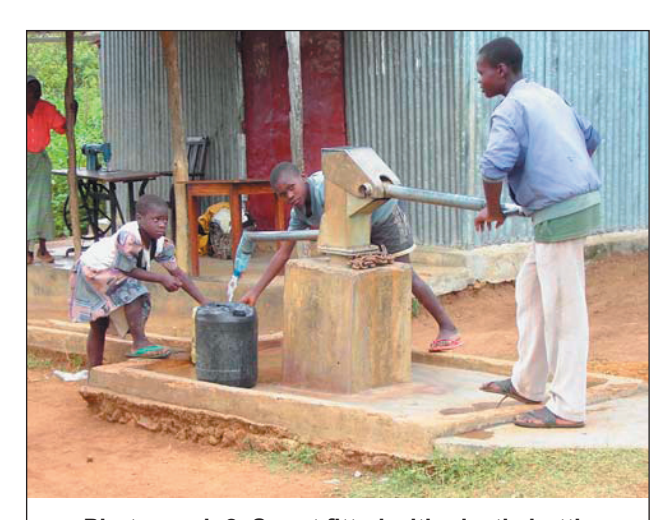
Photograph 2. Spout fitted with plastic bottle