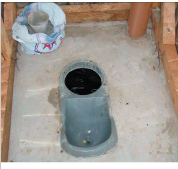
Photograph 5. Ecosan toilet

On-site disposal systems are promoted in the area due to lack of infrastructure to facilitate for off site disposal. The Ventilated Improve Pit (VIP) Latrine has been the most promoted in the region. Recently though, the concept of the Ecosan toilet was introduced and is receiving good response from the community. Ever since its introduction in 2003, there have been 43 units of Ecosan toilets which have been constructed in homesteads. The Ecosan toilet uses the concept that faeces and urine are not mixed and human waste matter