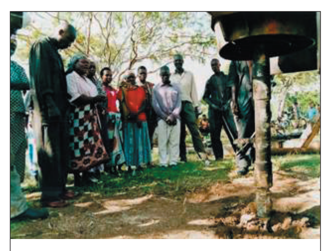
Photograph 1. Prayers before drilling commences

Some of the advantages mentioned by the groups with the responsibility over the water points of the Afridev pumps include: