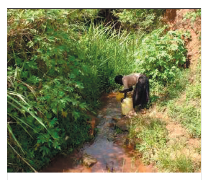
Photograph 3. Spring before protection