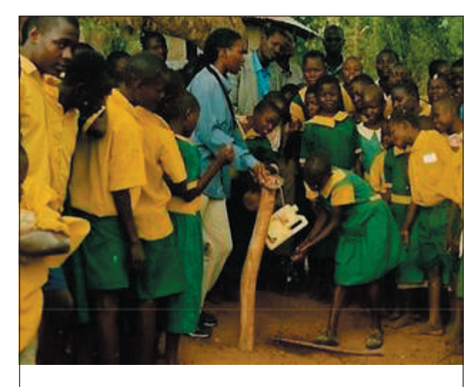
Photograph 6. Taking turns to use the tippy tap at school

This is a concept which was introduced to the region when two of the project staff came to Uganda to attend a WaterCan workshop and were able to see it being implemented. The initiative has gained popularity in the region with people putting it up in their homesteads and in institutions. The