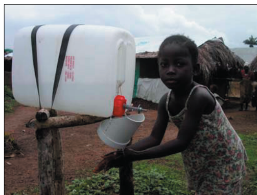
Photograph 3. Utilisation of Captap 2