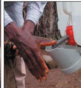
Photograph 2. Utilisation of Captap