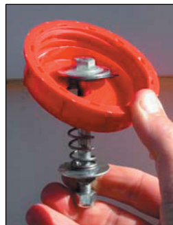
Photograph 1. The Captap operation

The water dispensed from the Captap flows into a hand-wash reservoir that is suspended by string or wire from the jerry-can handle (See Photograph 2). The container has two 3mm holes drilled into the bottom, which allows the water to flow out at a rate of approximately 10ml/second. The hand-wash reservoir affords the user hands free handwashing, thus avoiding the recontamination of clean hands by having to touch the device a second time (See photograph 3). Photographs 2 and 3 show the hand-wash reservoir and the two steps required to complete hand-washing. The Captap uses between 200 and 300ml of water to complete one hand-washing procedure.