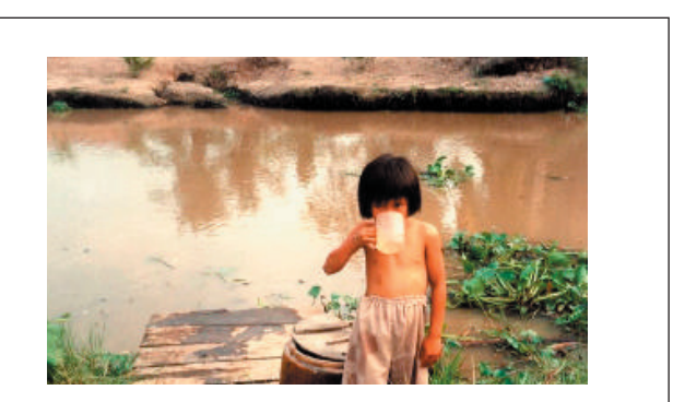
Photograph 1. Before Project Scenario

Binh Phu is one of the clusters developed in Tan Hong District of Dong Thap Province. This cluster has been developed near a district road, about 6 km from the district town. Men and women who lived in many hamlets located in the flood plains have been shifted to this residential cluster,