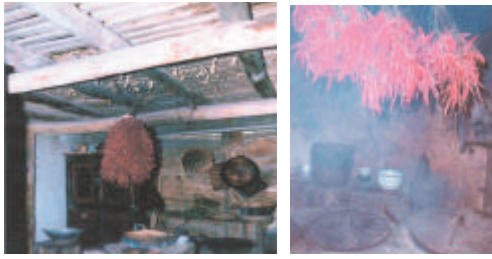
Photo 3. & 4. Burning coal in kitchen stoves for cooking and drying corn and hot peppers, Guizhou province.