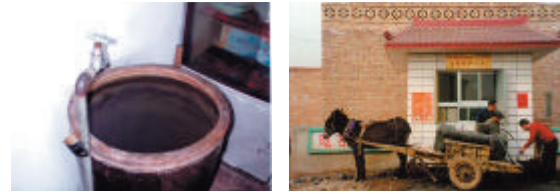
Photo 5. Arsenic safe piped water supply to village home