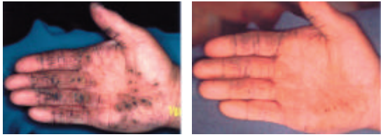
Photo 7. Hyperkeratosis on the palm of an arsenicosis patient before consuming arsenic-safe water supply