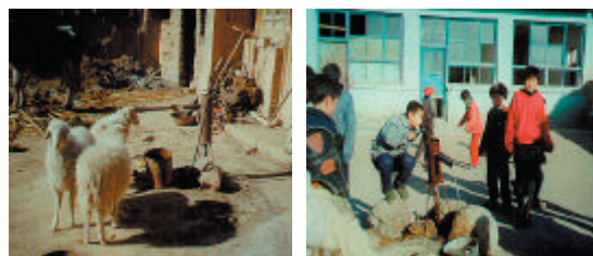
Photo 1. & 2. Wells fitted with hand pumps in a house compound and a school